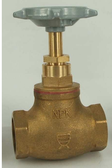
Model No: SV001