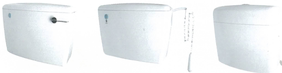
Table of Summary